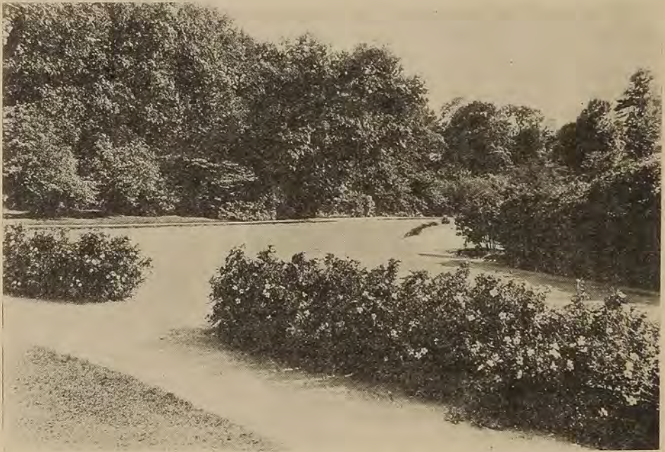
Wild Roses and a Bit of Meadow Road.

From the Arnold Arboretum, Jamaica Plain, Mass.