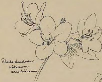
Rhododendron obtusum araliaceum