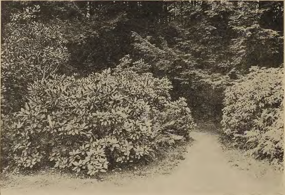
Entrance to Hemlock Grove.

From the Arnold Arboretum, Jamaica Plain, Mass.