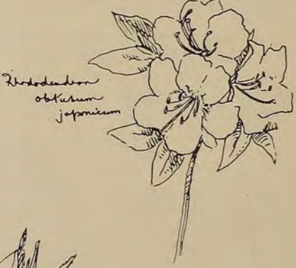
Rhododendron obtusum japonicum