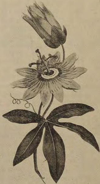
Title Page and Three Plates of American Plants from the First Volume of Curtis Botanical Magazine, 1787.