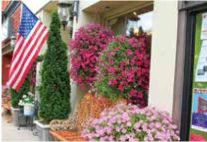
Flowers brighten a commercial area in AIB participating town of Ottawa, Illinois.

COMMUNITIES ACROSS the country have until February 28 to register for the 16th annual America in Bloom (AIB) competition. This friendly contest allows participants to showcase their beautification and environmental efforts for a national audience.