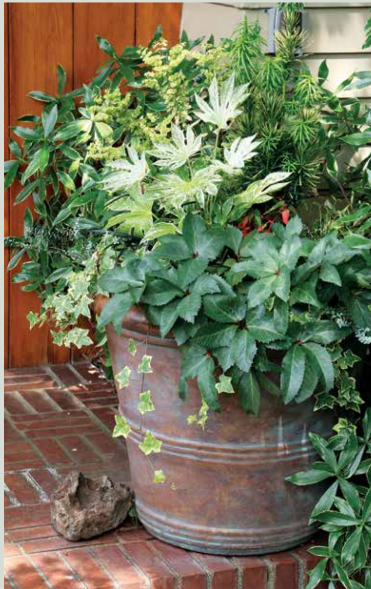
A sun-dappled location by an entrance is perfect for this collection of plants that prefer part shade, among them Fatsia japonica 'Spider's Web', hybrid hellebores, Hedera helix 'Gold Child', and Cephalotaxus harringtonia .