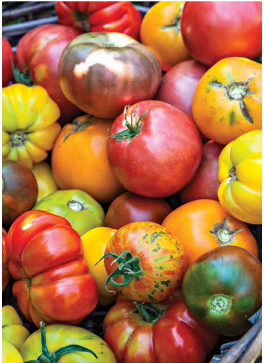
Heirloom tomatoes come in all shapes, sizes, colors, textures, and flavors.

Although I was introduced to gardening by family members at a very early age, it wasn't until after discovering and joining