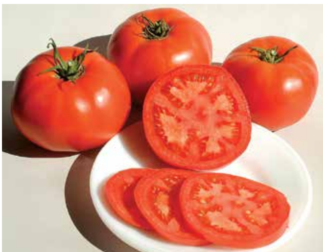
The author considers the red variety ‘Nepal’ among the best heirlooms for flavor.

So with all of the wonderful varieties of heirloom tomatoes available, how can the average gardener hone in on a select few to take up their precious and finite growing space? To provide some guidance, I asked Lockhart, Male, and several other true tomato-growing, tomato-eating aficionados