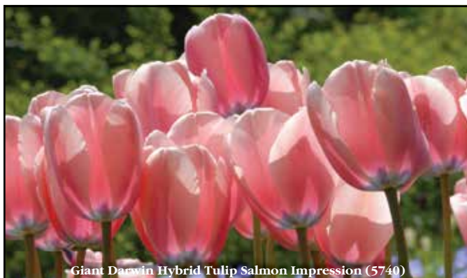
Giant Darwin Hybrid Tulip Salmon Impression (5740)