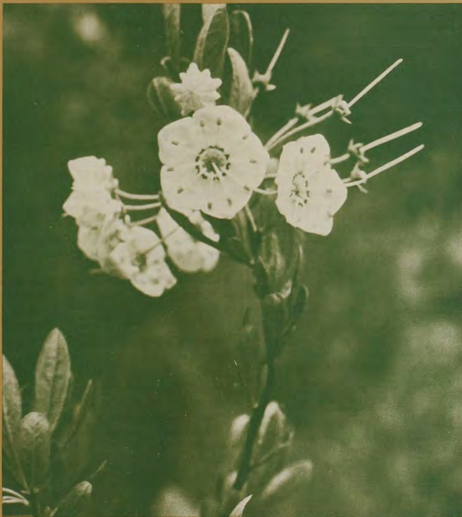
Kalmia cuneata , commonly called white wicky, is an endangered plant native to North and South Carolina.

According to the Endangered Species Technical Bulletin , December, 1981, "The market for certain plants, including cacti, orchids, and several carnivorous (insectivorous) plants is quite lucrative. Therefore, in the recent past suppliers have not hesitated to violate state laws as well as regulations that protect plants in national parks and other Federal lands." The new amendments will allow the Federal government to investigate violations of state laws anywhere within the United States and should help to control the illegal traffic. Last year