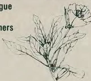
Oenothera missouriensis Ozark Sundrops

Issued Spring and Fall, each contains an abundance of hardy plant varieties and useful cultural information.