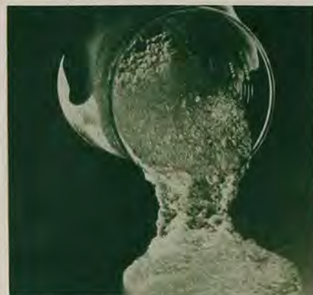
A super absorbent is shown here in its gel-like form.

Water held as a gel by these compounds is fully available to plants and will remain in the soil until it is extracted by plants or until it evaporates. The gels will re-absorb water whenever it is available, thus creating a sort of shrink-swell cycle. These super absorbents will last through many such cycles, and in a growing environment they will re-