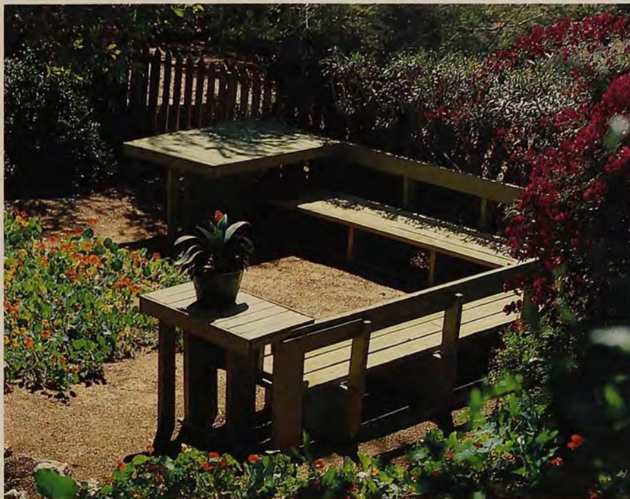
Bougainvillea and nasturtiums add beauty to a sitting area in Las Palmas Altas, a garden in Phoenix, Arizona. For more information about this remarkable desert garden, turn to page 28.