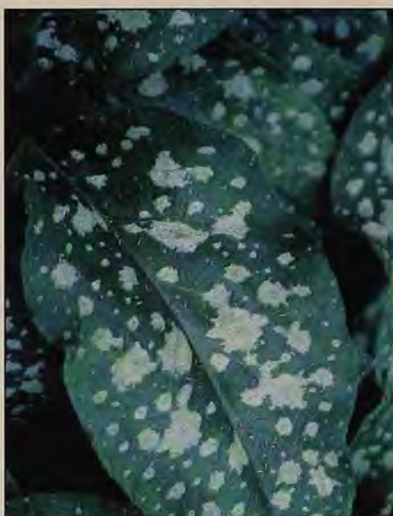
Pulmonaria 'Mrs. Moon'.

If you like yellow variegated aucubas, then you'll probably also appreciate Ligularia tussilaginea 'Aureo-maculata', or