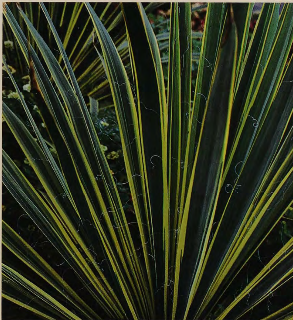
Yucca filamentosa 'Bright Edge'.

F ew plants are in flower for longer than two months, and two weeks is nearer the mark for most. Foliage plants earn their place for half the year, and a few the whole year long. Many also have beautiful flowers. What more could one ask? Perhaps that they are of easy culture and don't fall prey to the many ills our gardens are heir to. That's a tall order, but one that's met by plants sold (probably incorrectly) as Yucca filamentosa , or Adam's needle. Y. filamentosa has tough, untearable, swordlike leaves that form stout, trunkless clumps less than three feet high. A white pencilling edges each leaf, and this peels back at intervals into