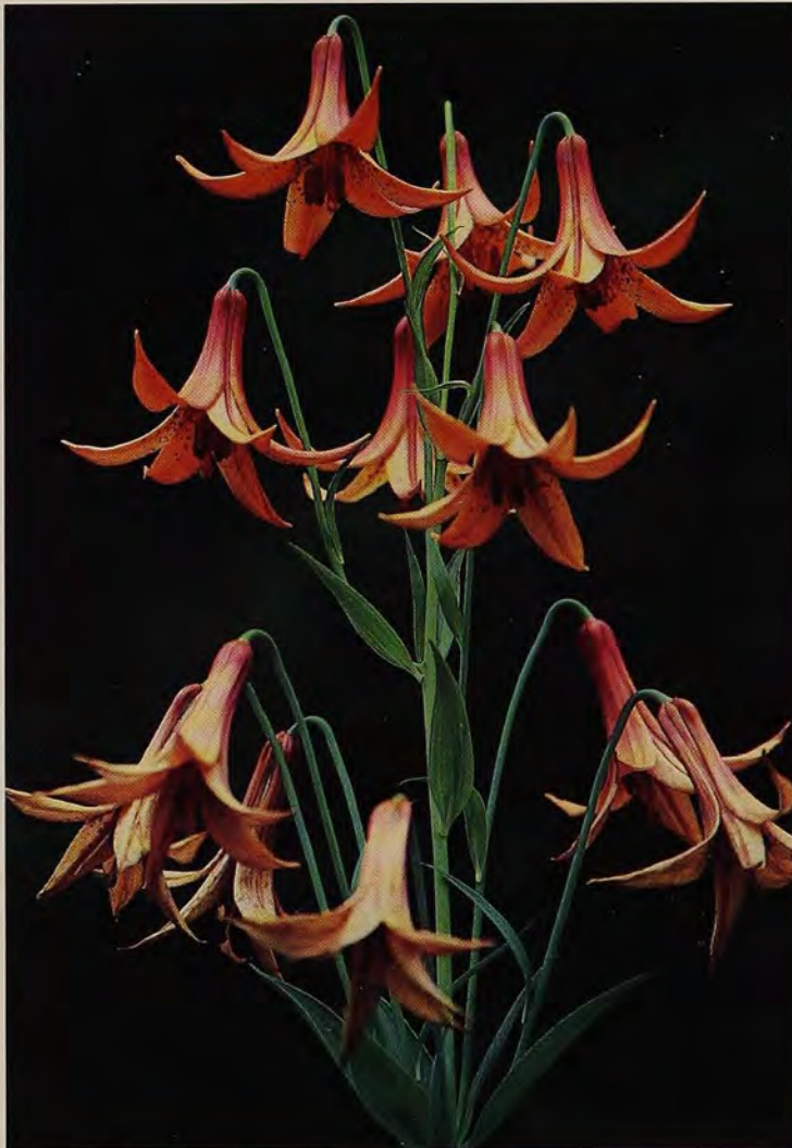
The Blaschka glass flowers are so lifelike, it is difficult to distinguish the live specimen from the glass model. ABOVE: Meadow lily, Lilium canadense , photographed in the wild. RIGHT: The lily's glass counterpart, housed in Harvard's Botanical Museum.