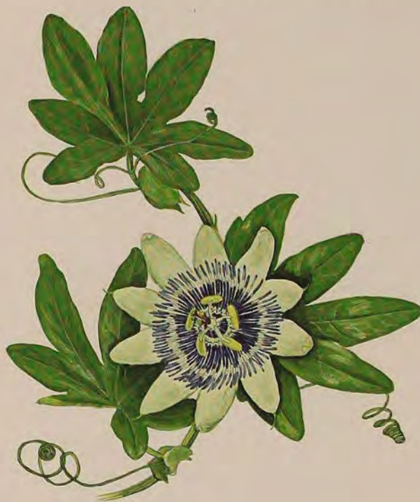
Passiflora caerulea , blue passionflower.

TEXT AND ILLUSTRATIONS BY KATHLEEN CRAWFORD