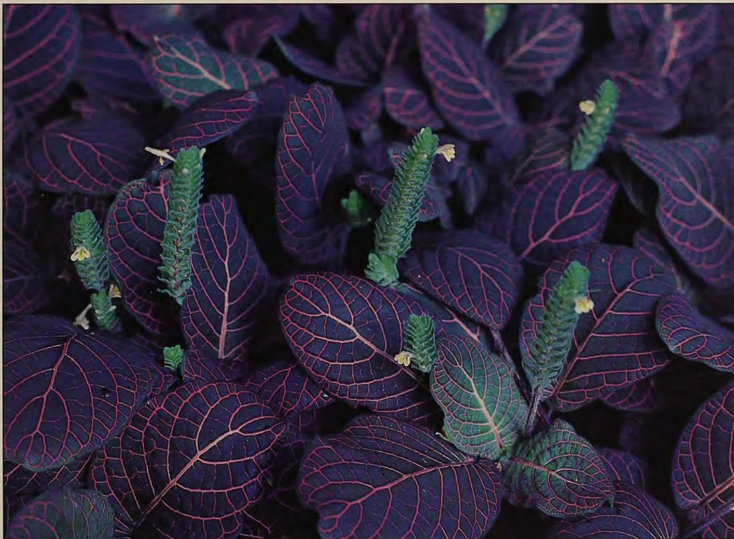
Fittonia versaffeltii var. versaffeltii , a commonly grown house plant that is native to Colombia and Peru. Its common names include mosaic plant, silver-net and silver-nerve.

An appealing and modest member of the cast found on many living room tables and in many window gardens is Fittonia . An Andean genus of only two species, this plant was named after Elizabeth and Sarah