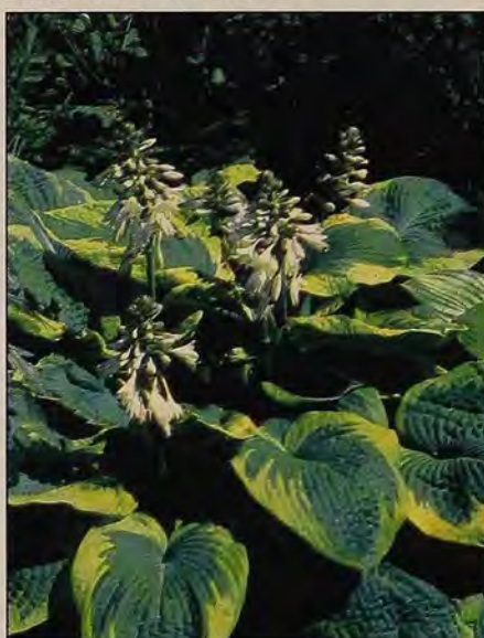
Hosta sieboldiana 'Frances Williams'. RIGHT: Athyrium goeringianum 'Pictum'.

leopard plant, which sells on sight to flower arrangers. Each large, glossy-green, rounded leaf is coin-dotted bright yellow. The prettiest patch I've seen was in dappled shade combined with blue bugleweed.