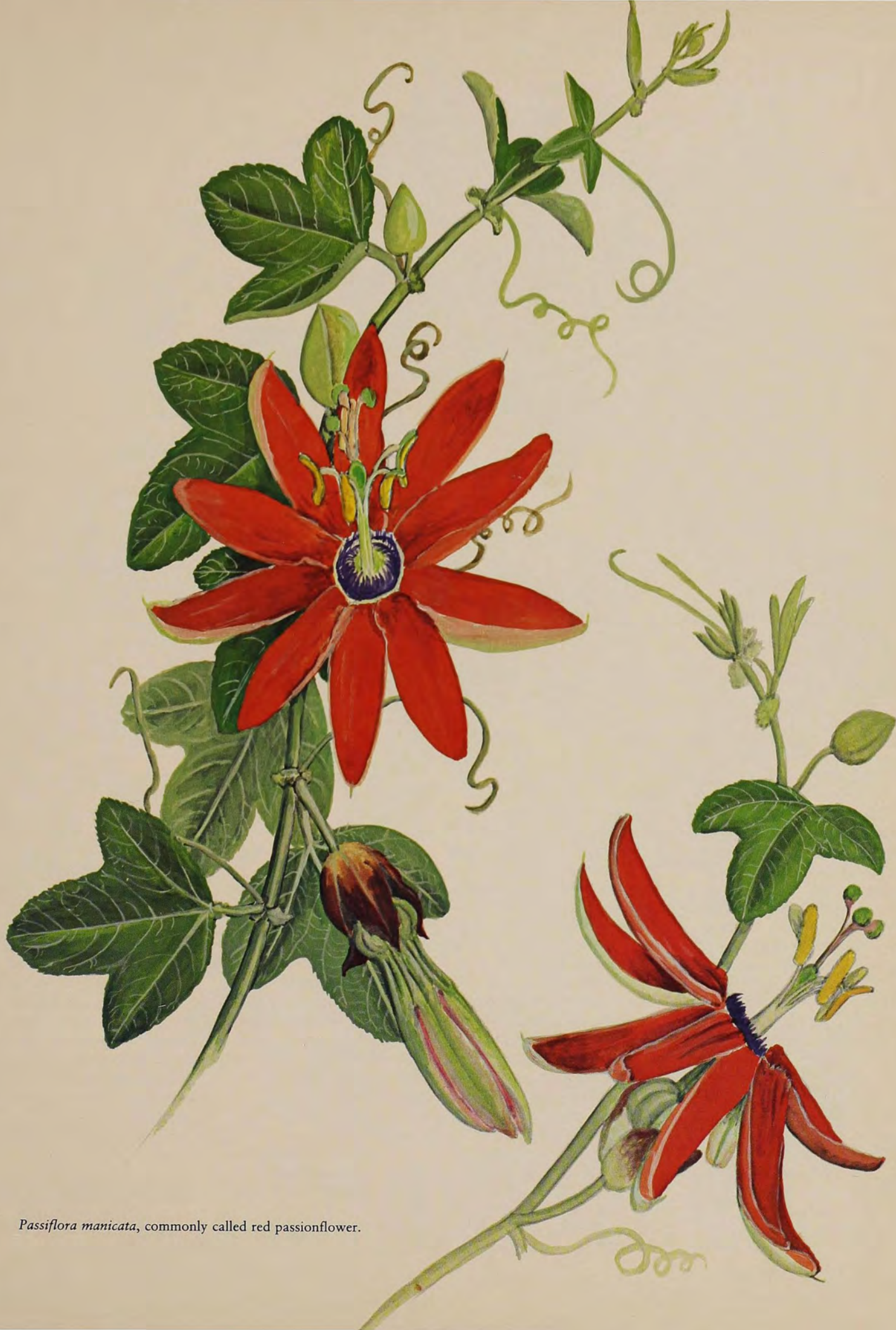
Passiflora manicata , commonly called red passionflower.