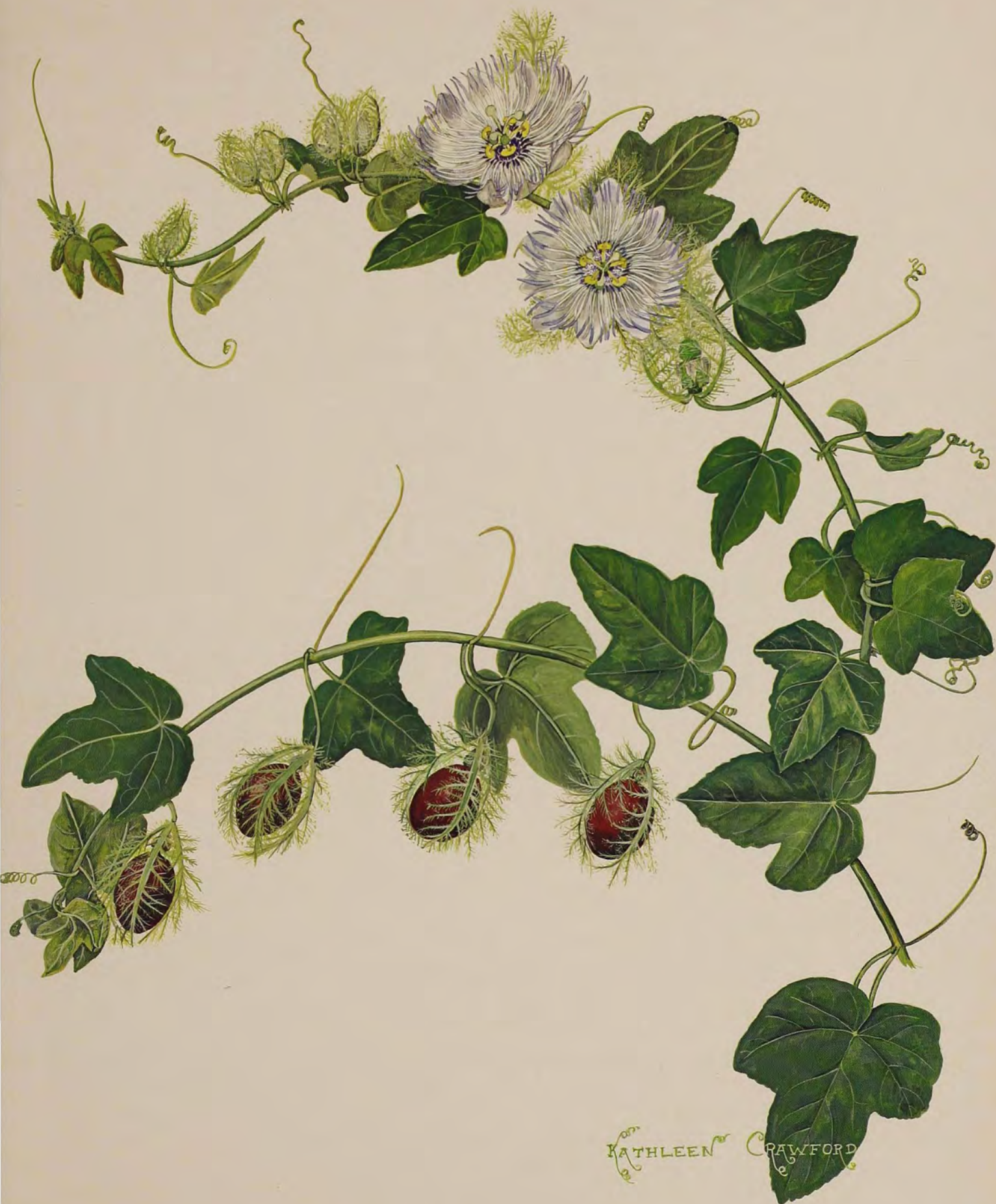
Passiflora foetida , commonly called running pop, love-in-a-mist or wild water lemon.