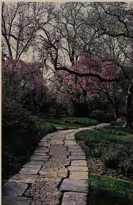
Garden paths can take many forms. Here, a stone walkway contrasts with a wide grass path. Both serve the same purpose—to lure the visitor through the garden.

All too frequently a landscape develops without a preconceived plan, the placement of structures and features the result of expediency rather than logic or aesthetic sensitivity. Paths not only divide and shape