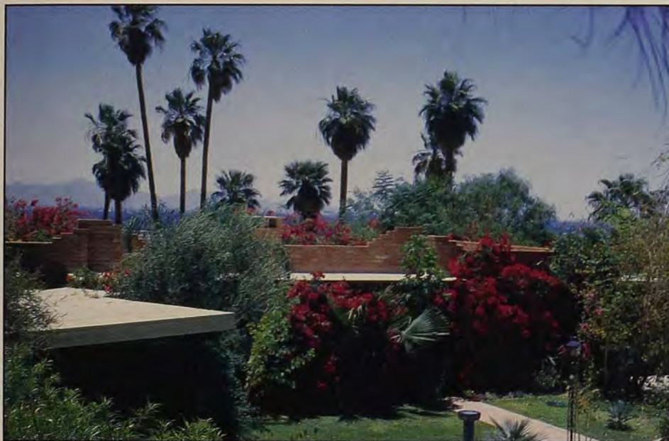
FAR LEFT: A sitting area in the lower garden surrounded by bougainvillea and nasturtiums. TOP LEFT: Partially shaded by palms, the swimming pool glistens in the Arizona sun. Mosaics on the bottom of the pool give the illusion of swimming fish. LEFT: Tall palm trees tower over the garden and home, which were named after them. ABOVE: Buttercups, Ranunculus sp., deck paths and walkways throughout Las Palmas Altas.

horticulturist. "I also wanted a tropical garden where I could grow orchid trees ( Bauhinia sp.), bougainvillea and Jacaranda trees. To accomplish this, we had to provide an area that was as frost-free as possible." High shade as well as frost protection are provided by tall palms, olive and eucalyptus trees, oleander and arbovitae.