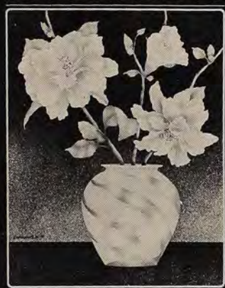
NEW YORK BOTANICAL GARDEN Print Gallery