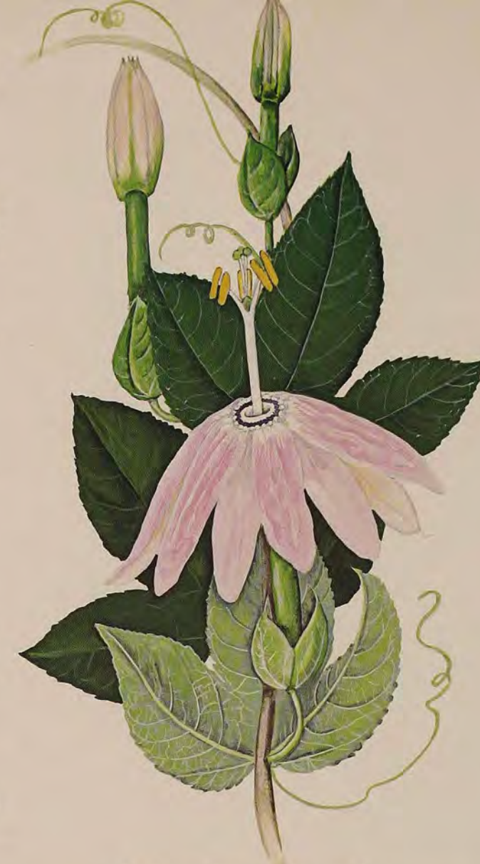
Passiflora mollissima , pink passionflower.

P. foetida , dawn passionflower, has a wide distribution in South America