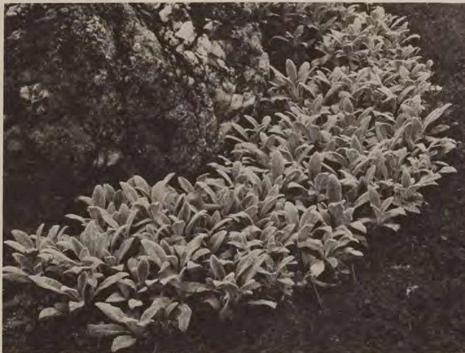
Stachys byzantina (lamb's ears), universally loved for its "touchable" texture and silvery-gray color, is a good choice for sunny areas. Here, it gently encircles the harsher contours of a rock.

New York, also recommends a white cultivar, 'Miss Jekyll's White', that she has used with success in mass plantings under hickories and with rhododendrons; she commends the cultivar for tolerance to sun and to exceptionally wet or dry conditions.