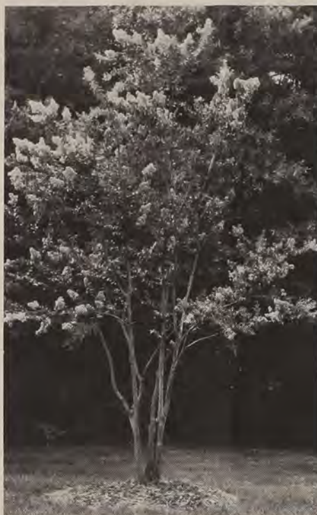
Lagerstroemia ‘Biloxi’ (left) provides year-round interest with clear pink flowers in summer, orange-red to dark-red leaves in autumn, and a beautiful mottled gray-brown to dark-brown trunk. Right: Lagerstroemia ‘Lipon’.

Lagerstroemia ‘Biloxi’, ‘Miami’, and ‘Wichita’, mildew-resistant small trees whose sinuous, mottled trunks begin peeling at about three to five years old. These cultivars flower profusely in early summer and continue to flower through September. ‘Biloxi’ has pale-pink flowers, orange-red to dark-red leaves in autumn, and a mottled