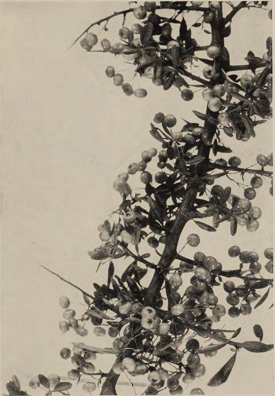
Pyracantha crenulata kansuensis