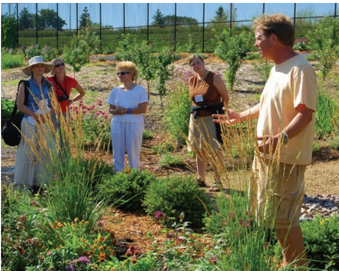
AHS National Children & Youth Garden Symposium in Minnesota

cles exploring the diverse world of gardening and horticulture in North America. Topics covered in FY 2008 ranged from backyard orchards to composting, designing pathways, hardy terrestrial orchids, and winter-blooming shrubs.