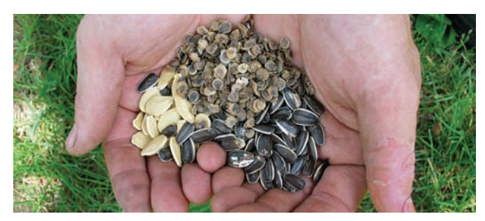
The AHS Annual Seed Exchange, which celebrated its 50th anniversary in 2009, allows members to share rare, uncommon, and favorite varieties with other gardeners nationwide.