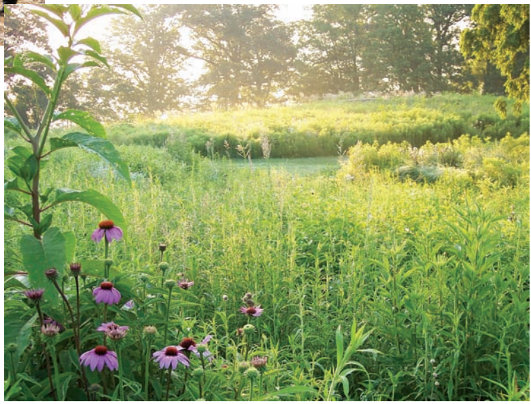
Since the first phase of planting began in 2004, the André Bluemel Meadow at River Farm has come into its own as a dramatic example of sustainable gardening.

Once owned by George Washington, River Farm's 25 acres of lawns, meadows, and formal gardens surrounding the Estate House combines historic significance with contemporary relevance. Since the AHS acquired River Farm for its national headquarters in 1973, the property has been a meeting place for horticultural and community groups and a green space for families to enjoy. It also serves as a national platform from which to promote horticultural innovation, practical experimentation, and conservation.