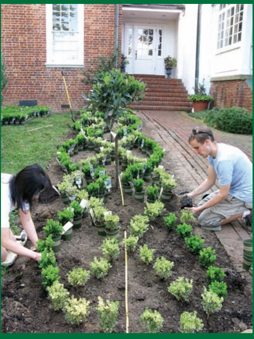
Making America a Nation of Gardeners, a Land of Gardens