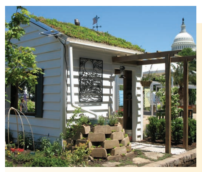
The AHS's Green Garage display was part of the U.S. Botanic Garden's "One Planet—Ours!" exhibit on the National Mall in Washington, D.C.

Along with the Society's members-only webinars, the AHS Garden School program offers participants the opportunity to get first-hand insights into a variety of timely topics such as creating a water-thrifty garden and gardening with native plants.