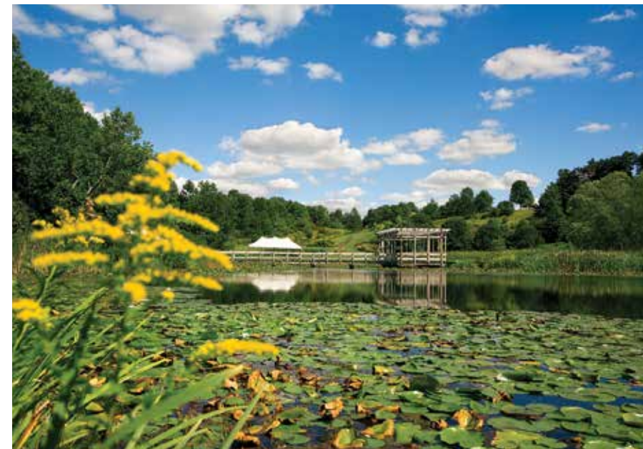
The F.R. Newman Arboretum is a 100-acre expanse of majestic trees and pastoral landscapes.

The Brian C. Nevin Welcome Center serves as CBG's hub. From here, visitors can explore 12 different specialty gardens that surround the award-winning, sustainable building. For example, the Robison York State Herb Garden is home to 500 varieties of herbs curated to represent 17 themes, including Herbs of the Ancients, Edible Flowers, Medicinal Herbs, Herbs of Native Americans, and Economic Herbs. The Groundcover Collection comprises