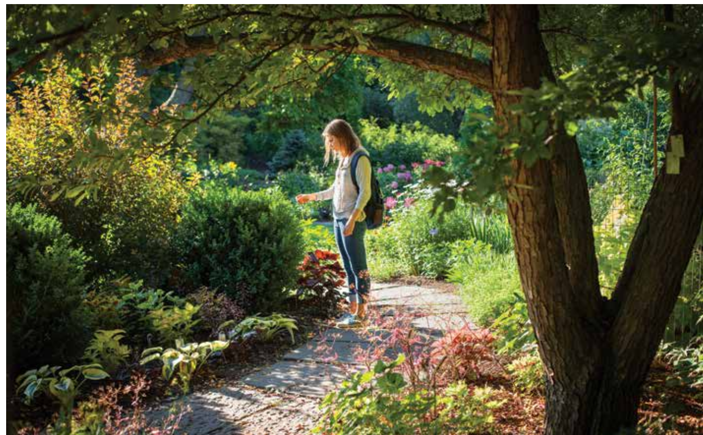
A student takes a break to admire the plants in one of Cornell Botanic Garden's themed areas situated on Cornell University's campus.

CORNELL BOTANIC GARDENS (CBG) in Ithaca, New York, sprawls across one of the nation's foremost research universities, allowing convenient access to students, faculty, and visitors alike. It comprises 35 acres of cultivated gardens, a 100-acre arboretum filled with magnificent specimen trees and shrubs, and miles of trails through numerous nature preserves. Together, these areas showcase the incredible natural beauty of the Finger Lakes region and contribute to its conservation.