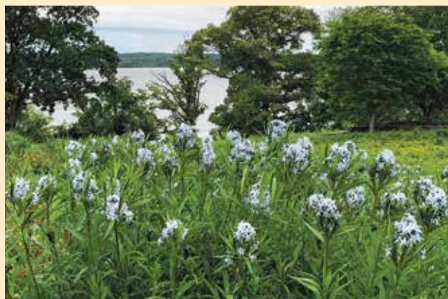
Native eastern bluestar ( Amsonia tabernaemontana ) blooms in clumps in the André Bluemel Meadow at River Farm.