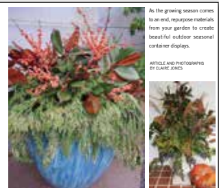
As the growing season comes to an end, repurpose materials from your garden to create beautiful outdoor seasonal container displays.