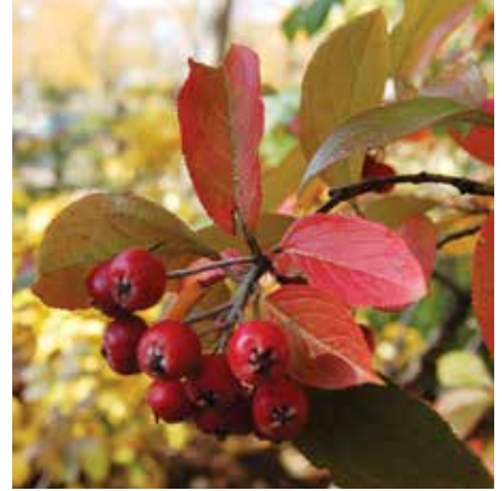
Red chokeberry features dainty spring blooms (left) that are followed in autumn by small red fruits (above), which become palatable to birds after exposure to low temperatures.

Hardiness Zones 5–9, AHS Heat Zones 9–1) is a versatile plant in the Smithsonian Gardens. It is prominently featured in an understory planting at an entrance and beside a nearby parking lot where it helps retain a sunny slope. It thrives in both locations, but the blooms are best in full sun. Its spires of fragrant, white blossoms draw nectar-loving insects like butterflies and bees. The plant's rich red-to-purple fall color, especially showy in a mass planting, will persist into the winter in southern areas where sweetspire is semi-evergreen. If you notice some of the foliage looking chewed, it might be caused by caterpillars of the American holly azure butterfly ( Celastrina idella ) for which this plant is a preferred host.