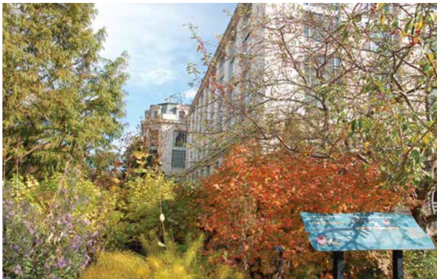
After putting on a colorful autumn show, fallen leaves in this mixed bed near the Smithsonian's National Museum of Natural History will be left on the ground for overwintering pollinators.