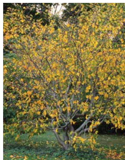
Above: A bumblebee searches for nectar on summersweet, which blooms in late summer. Top right: With flowers unfurling as early as January, ‘Purpurea’ Ozark witch-hazel helps to feed pollinators and add color to the landscape when little else is blooming. Bottom right: Common witch-hazel also produces pollinator-attracting flowers during the colder months, after its foliage turns yellow and drops in fall.

Chenault coralberry ( Symphoricarpos ×chenaultii , Zones 4–7, 7–1) called ‘Hancock’. It produces small, pinkish flowers in June and July that are usually covered with insects. We have a large grouping of it at the National Museum of Natural History to help retain a steep slope. These suckering shrubs only reach about two feet in height but can spread up to 12 feet, so we often need to trim them back. However, they constantly attract so many pollinators that our gardeners refrain from working with these plants during bloom time. Ornamental, rosy