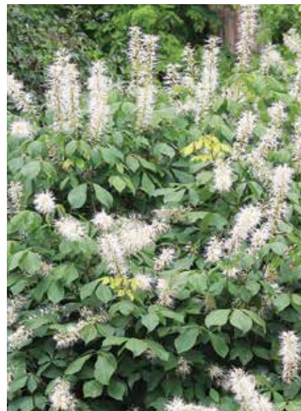
Two summer-blooming pollinator favorites are sun-loving lead plant, left, and bottlebrush buckeye, above, which prefers shade.

at the entrance to the Pollinator Garden. Round, reddish-brown fruits follow, which can last into winter. This plant gets six to 12 feet tall, and though it is adaptable to most growing conditions, it does best in a damp, partly shady location.