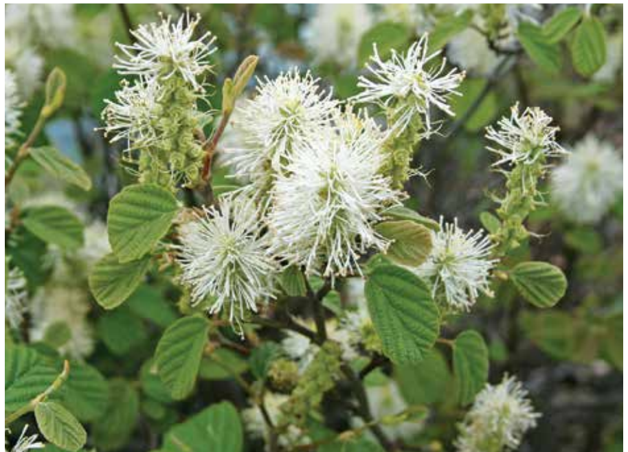
Dwarf fothergilla produces fragrant, nectar-rich blooms that attract bees in spring.

Running serviceberry ( Amelanchier stolonifera , Zones 4–8, 8–4) is another plant that has the benefit of showy white blooms in May for pollinators, edible berries in summer, and striking fall foliage. As its name