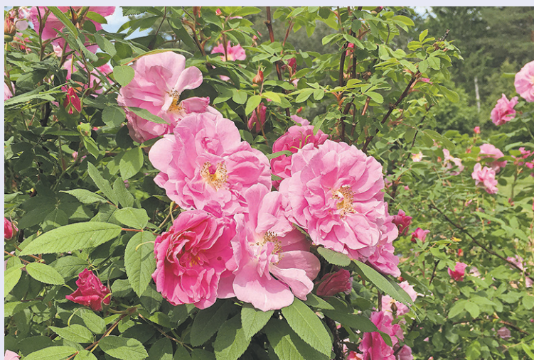
BERKSHIRE BOTANICAL GARDEN

One of the Northeast's older public display gardens, this 24-acre property showcases more than 3,000 species and varieties of herbaceous and woody plants in the display gardens. Explore the serene pond garden, stroll along the iconic daylily walk, check out the historic 1937 herb garden and pop into the Martha Stewart Cottage Garden, which has a shed boasting a living sedum roof. Don't miss Lucy's Garden, billed as a whimsical topiary collection of nearly two dozen exotic living sculptures.