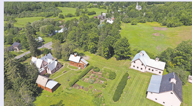
FRIENDS OF MORRILL HOMESTEAD