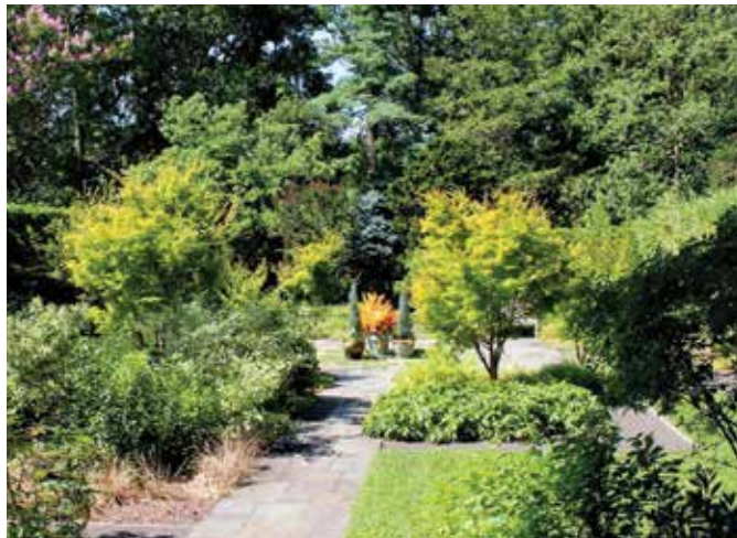
The Ambler Arboretum of Temple University offers more than 185 acres of gardens, woodlands, and meadows to explore.

Ambler Arboretum of Temple University , just north of Philadelphia, is a 187-acre natural site in the style of an outdoor