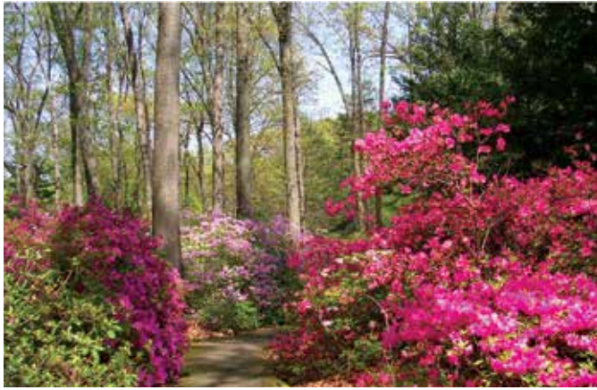
Blooming azaleas create a late spring and early summer feast for the eyes at the Jenkins Arboretum & Gardens.