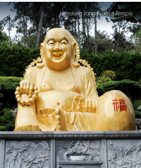
Haedong Yonggungsa Temple