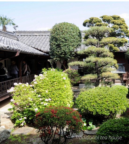
Traditional tea house