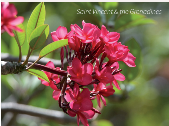
Saint Vincent & the Grenadines

Airfare; airport taxes; visa and passport fees and/or immigration reciprocity taxes; luggage, cancellation, medical, repatriation and accident insurance; personal expenses such as laundry, telephone; spa; and beverages other than those specified above.