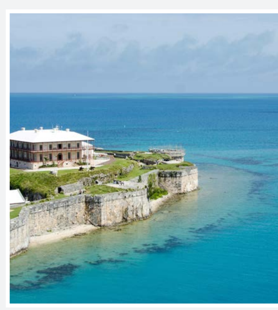
Photos (from top): Moongate, Bermuda ; St. Peter's Church, St. George ; Commissioner's House, Royal Naval Dockyard