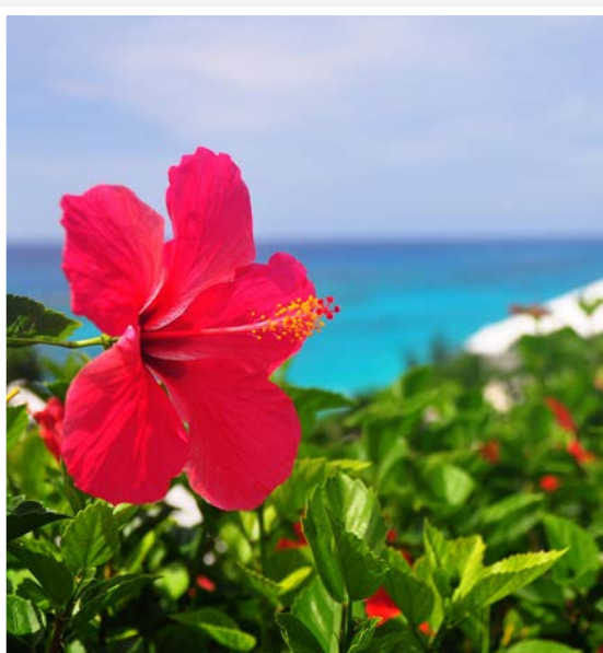
Photos (from top): Christmas Lights at King's Square, St. George (Vernaccia); Royal Poinciana Tree and Pink House, Bermuda (kansasphoto); Hibiscus on Bermuda (kansasphoto)