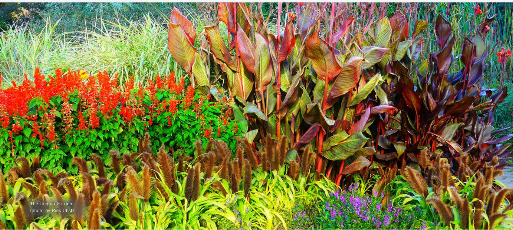
The Oregon Garden

When you travel with the AHS, you make a difference.