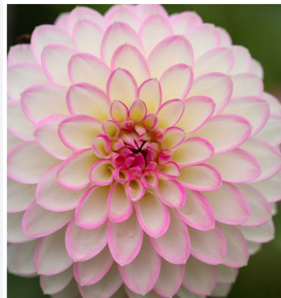
Photos (from top): Lan Su Chinese Garden, Window; Water feature at The Oregon Garden; Dahlia