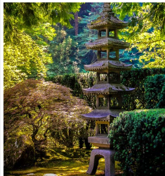
Photos (from top): Willamette Valley Wine Country ; Vineyard Grape Vines, Willamette Valley; Stone Pagoda at the Portland Japanese Garden