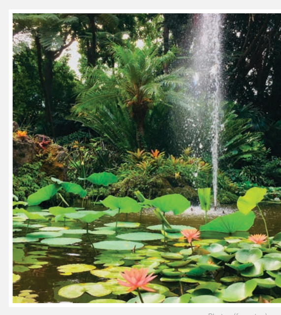
Naples (Hervé Simon); Caserta Palace (C1superstar); La Mortella Garden (2benny)