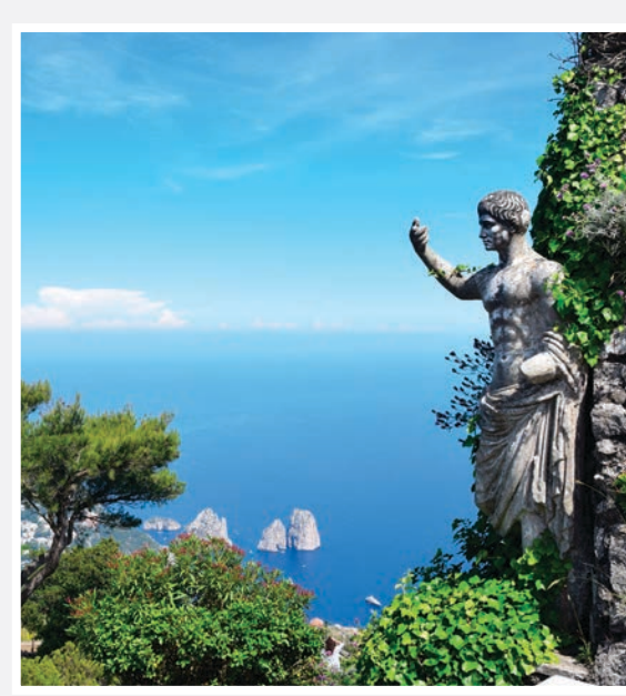
Photos (from top): Mary Magdalen Raised by Angels by Giovanni Lanfranco (c. 1616) at Capodimonte Museum; Sorrento Terrace ; Capri