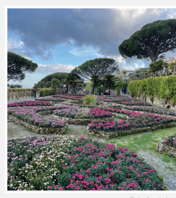
Photos (from top): Positano (user32212); Ninfa Gardens (WikiRomaWiki); Villa Rufolo in Ravello (Jordan Cook)