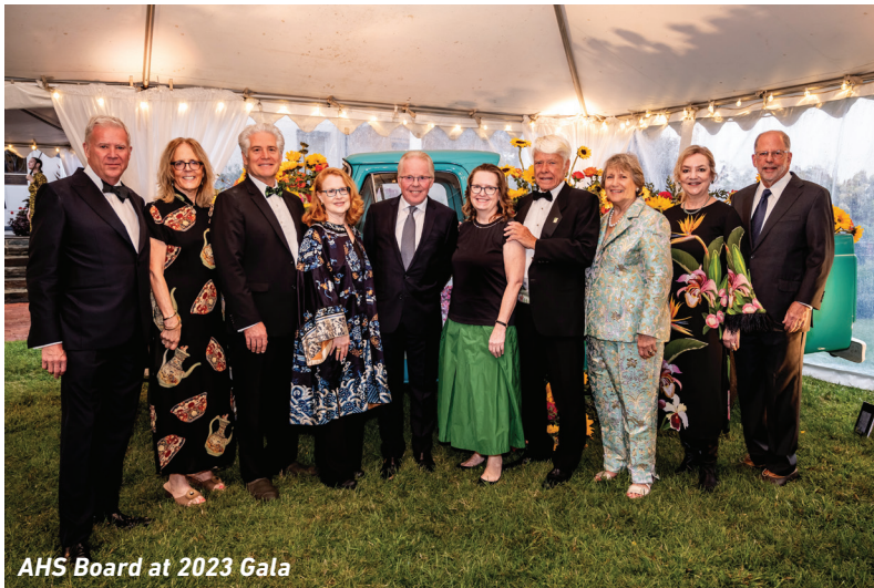
AHS Board at 2023 Gala