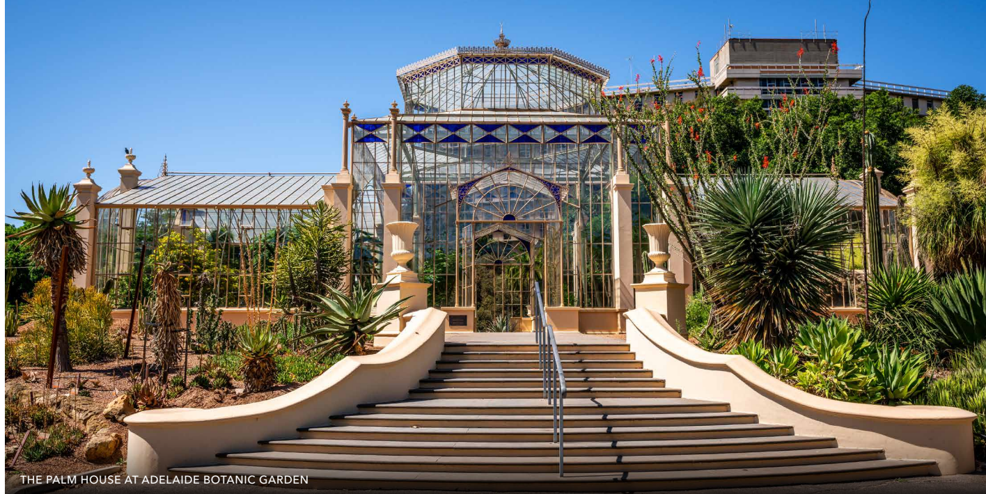
THE PALM HOUSE AT ADELAIDE BOTANIC GARDEN

This customized trip is part of the AHS Adventures travel program collection. For more information, visit ahsgardening.org/travel