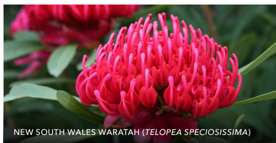
NEW SOUTH WALES WARATAH ( TELOPEA SPECIOSISSIMA )