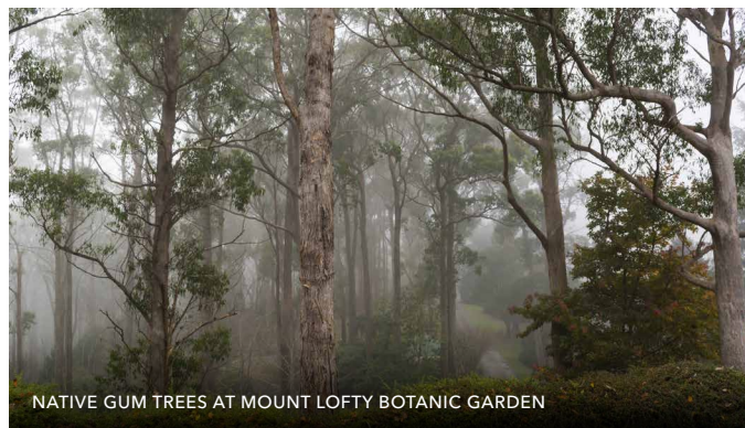
NATIVE GUM TREES AT MOUNT LOFTY BOTANIC GARDEN

Overnight at Crowne Plaza Melbourne. (BL)