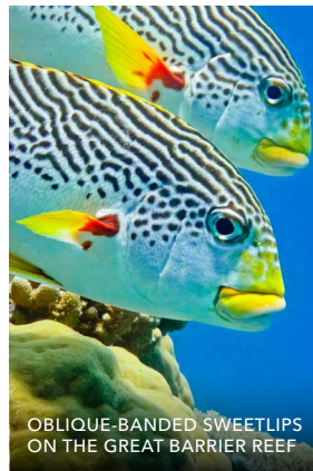
OBLIQUE-BANDED SWEETLIPS ON THE GREAT BARRIER REEF