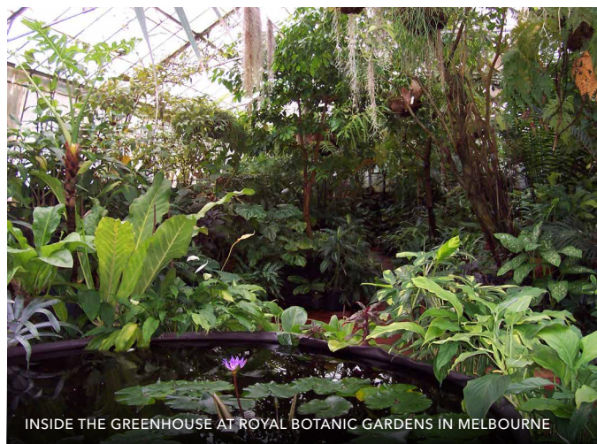
INSIDE THE GREENHOUSE AT ROYAL BOTANIC GARDENS IN MELBOURNE

You'll start the day with a short drive from Adelaide into the beautiful Adelaide Hills. No photos could ever fully capture the wonder and whimsy of Irene Pearce's "Tickle Tank." Every inch is filled with color and form, mosaics and sculptures, with careful planting to create a series of vignettes. You'll have some free time for lunch in Hahndorf Village, Australia's oldest surviving German settlement, followed by a visit to the Mount Lofty Botanic Garden, dedicated to the cultivation and display of the world's cool-climate plants. Collections include the Dwarf Conifer Lawn, Fern Gully, Heritage Rose Garden, Rhododendron Gully, South American Gully, and Southeast Asian Gully, to name a few. Return to Adelaide for an evening at leisure. Overnight at Crowne Plaza Adelaide. (B)