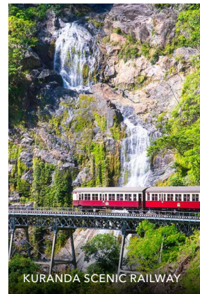
KURANDA SCENIC RAILWAY