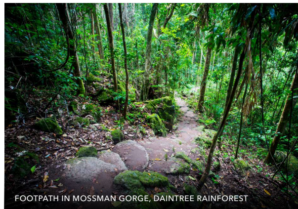
FOOTPATH IN MOSSMAN GORGE, DAINTREE RAINFOREST

Visits to Flecker Botanic Gardens—one of the best exhibitions of tropical flora in Australia—and to the private garden of a local landscape designer round out the experience.