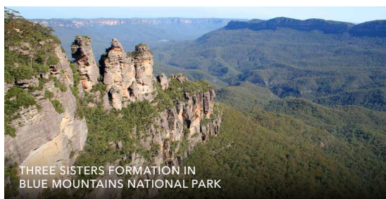
THREE SISTERS FORMATION IN BLUE MOUNTAINS NATIONAL PARK