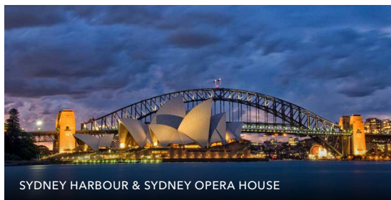
SYDNEY HARBOUR & SYDNEY OPERA HOUSE