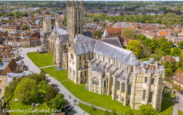
Canterbury Cathedral, Kent