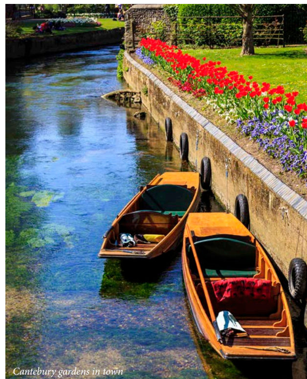
Canterbury gardens in town

Accommodations: Hotel du Vin, Royal Tunbridge Wells