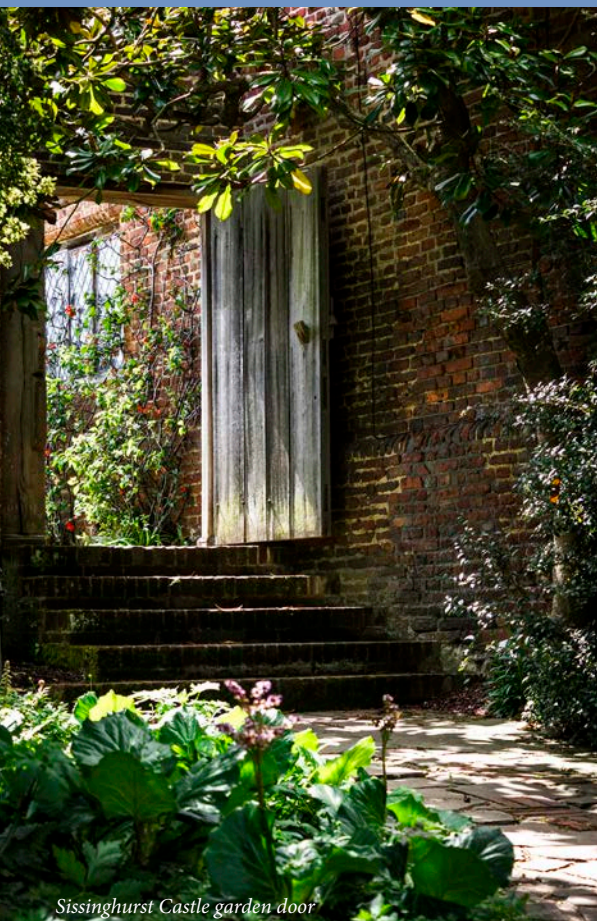
Sissinghurst Castle garden door