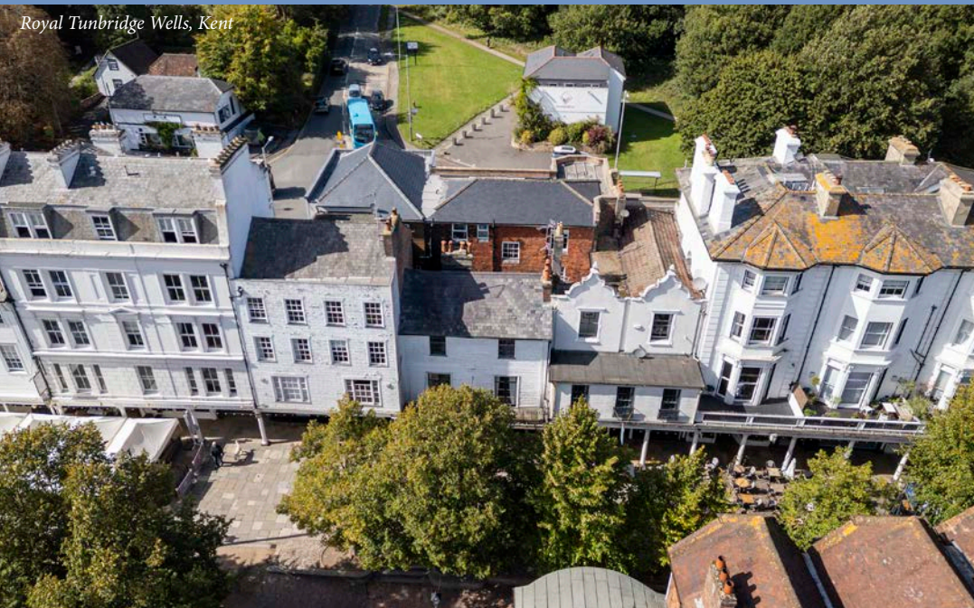
Royal Tunbridge Wells, Kent