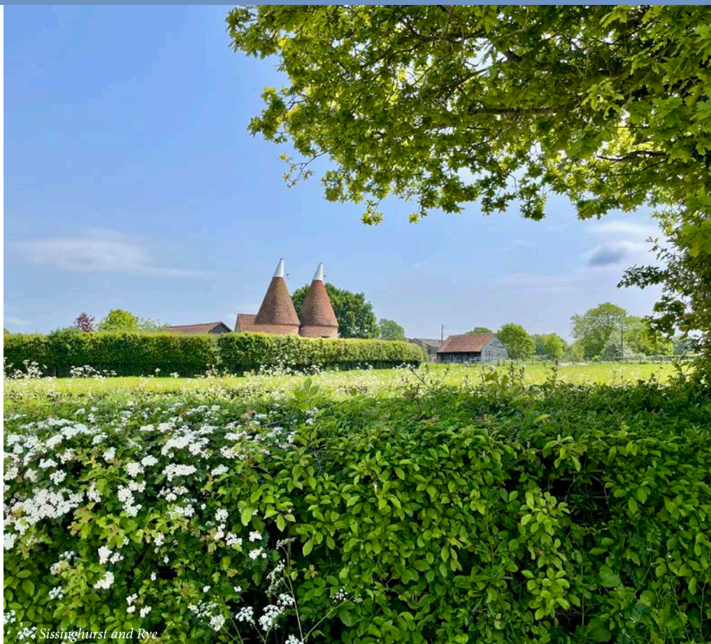
Sissinghurst and Rye