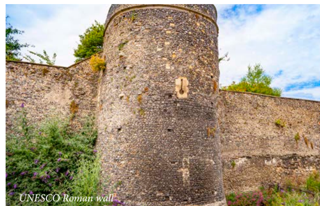
UNESCO Roman wall