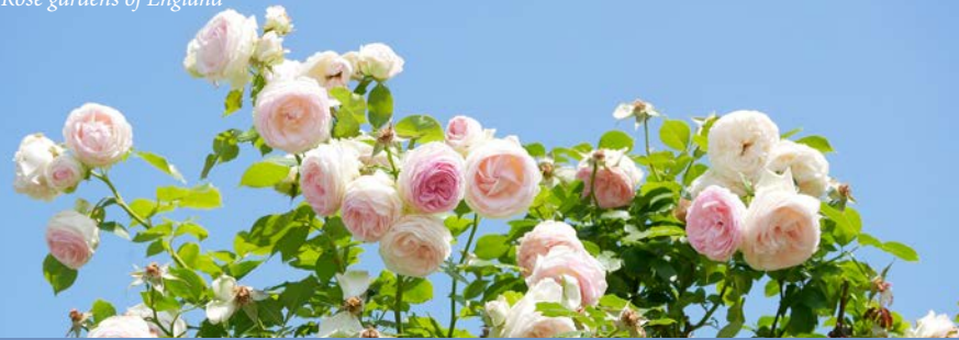
Rose gardens of England