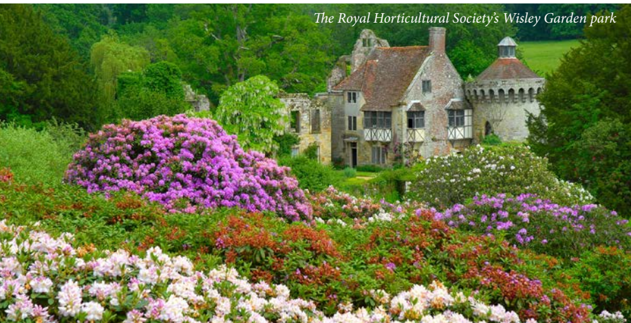
The Royal Horticultural Society's Wisley Garden park