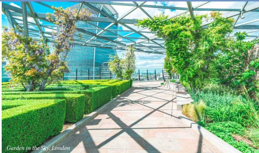
Garden in the Sky, London