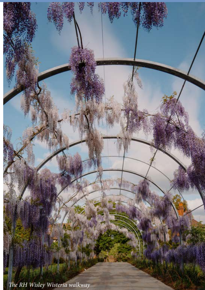
The RH Wisley Wisteria walkway