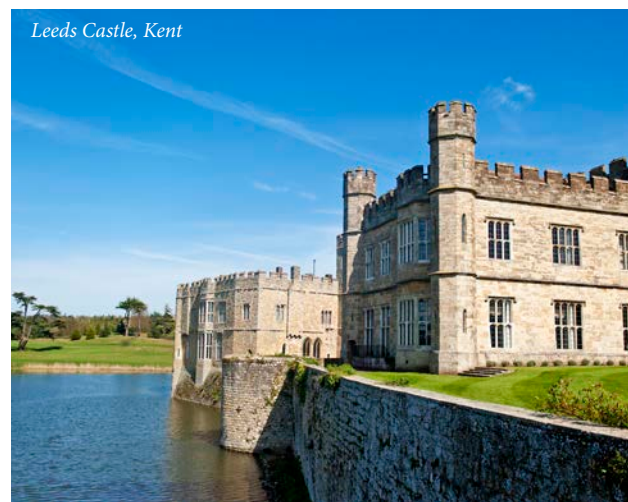
Leeds Castle, Kent

Accommodations: Hotel du Vin, Royal Tunbridge Wells