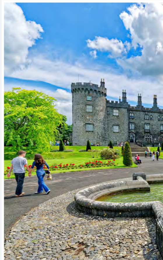
Kilkenny Castle