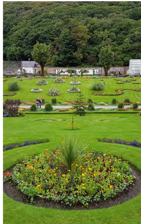
Victorian Walled Garden at Kylemore Abbey