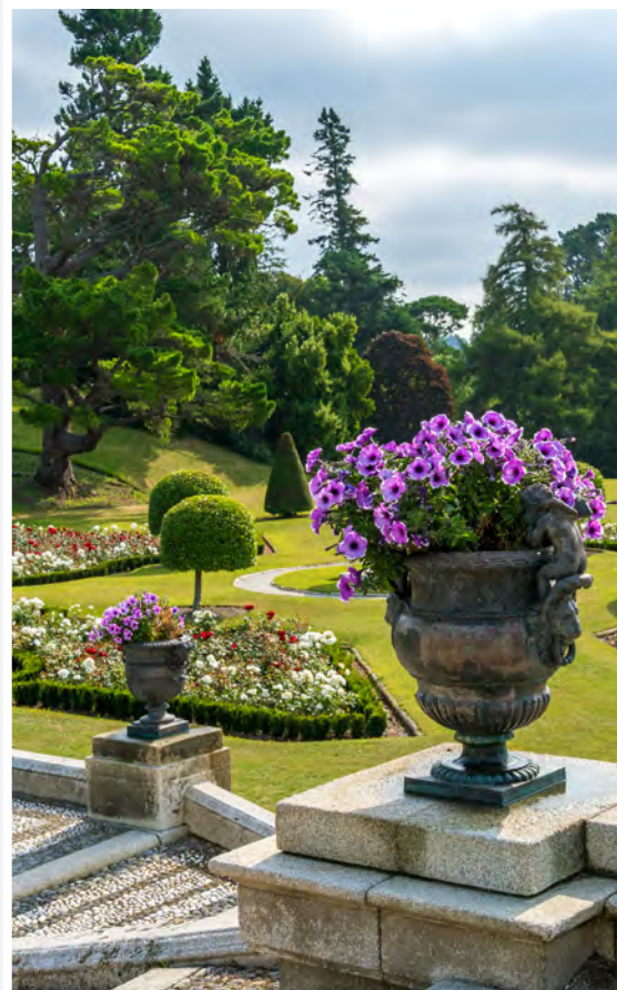
Gardens at Powerscourt

Start your morning at Airfield Estate, an exuberant farm and garden in Dublin City. The formal gardens span six acres and are composed of diverse spaces ranging from an ornamental walled garden, shade gardens and glasshouse spaces, to an extensive organic certified fruit, vegetable and edible flower garden. The gardens were first brought to prominence under the leadership of Jimi Blake whose innovative Hunting Brook Gardens we will visit on Sunday. Continue to