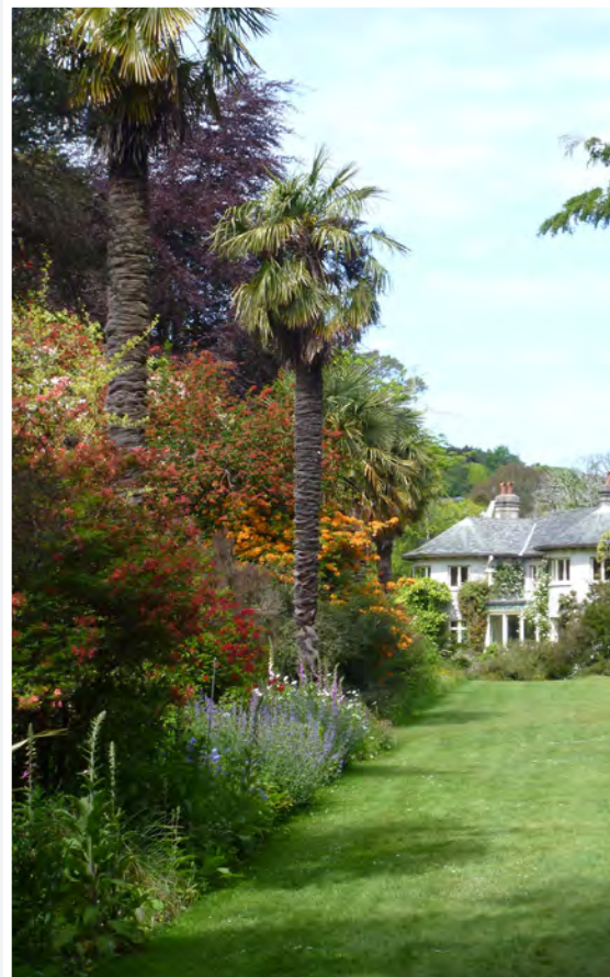
Mount Usher Gardens