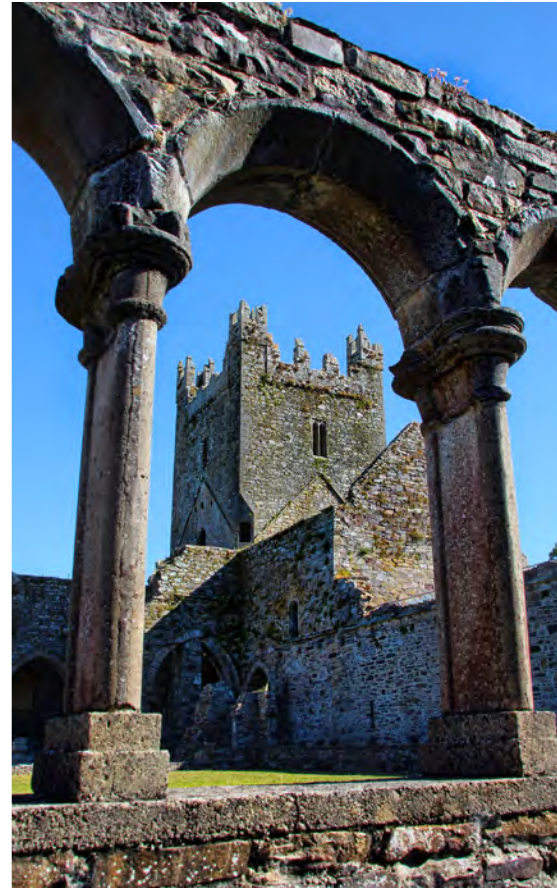
Jerpoint Abbey