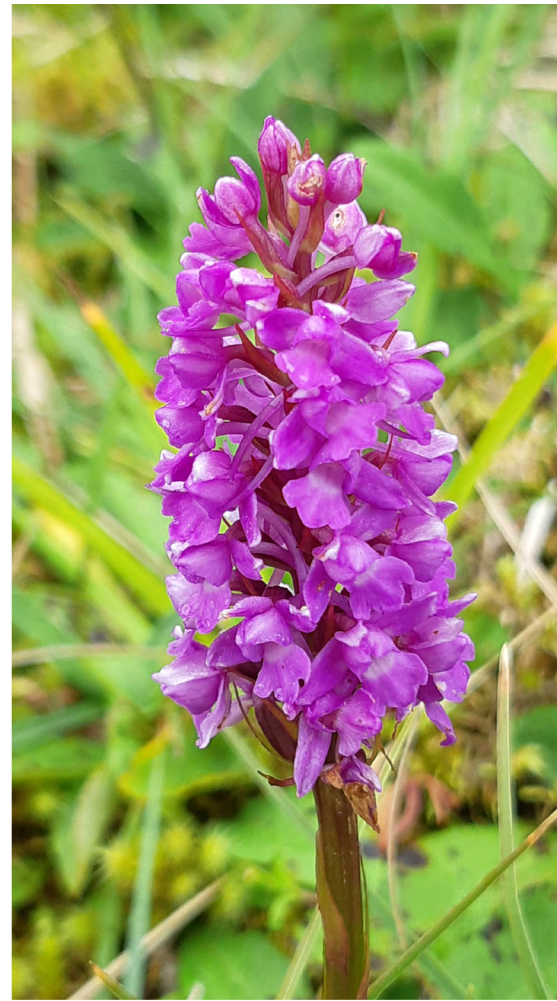
Wild Orchid in the Burren