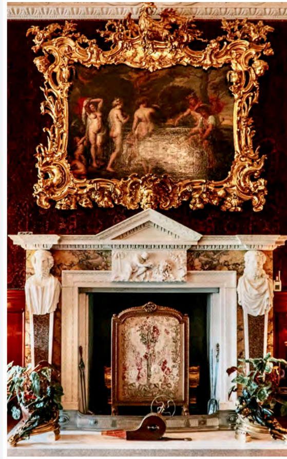
Russborough House Interior

Kilkenny River Court Hotel (Breakfast, Dinner)