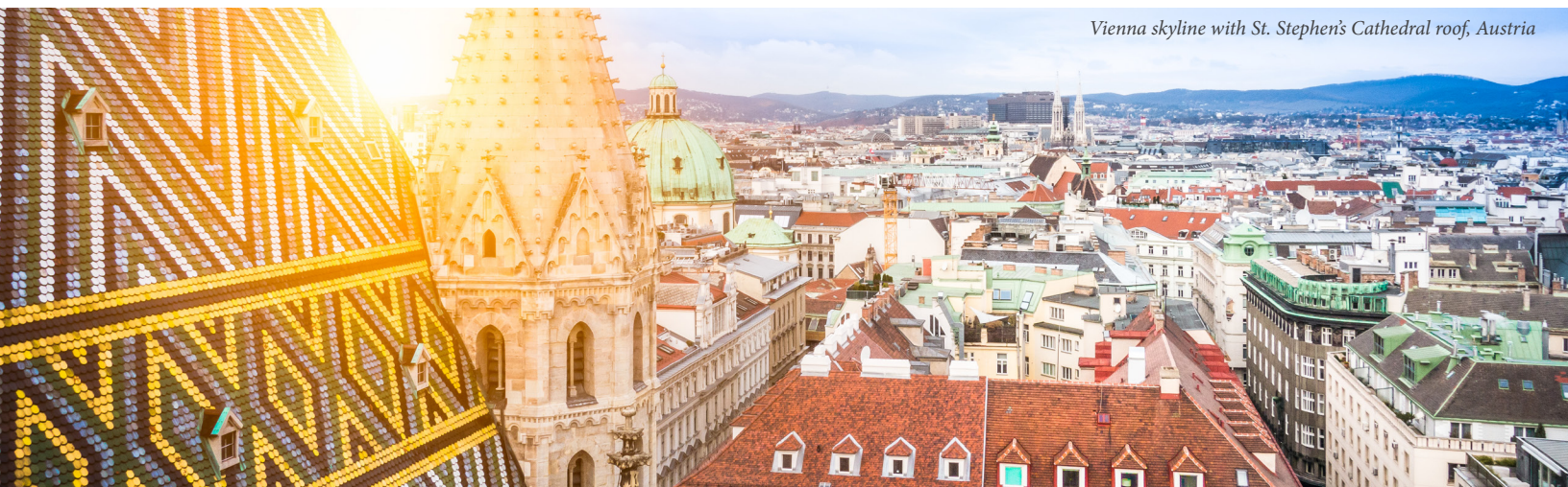
Vienna skyline with St. Stephen's Cathedral roof, Austria