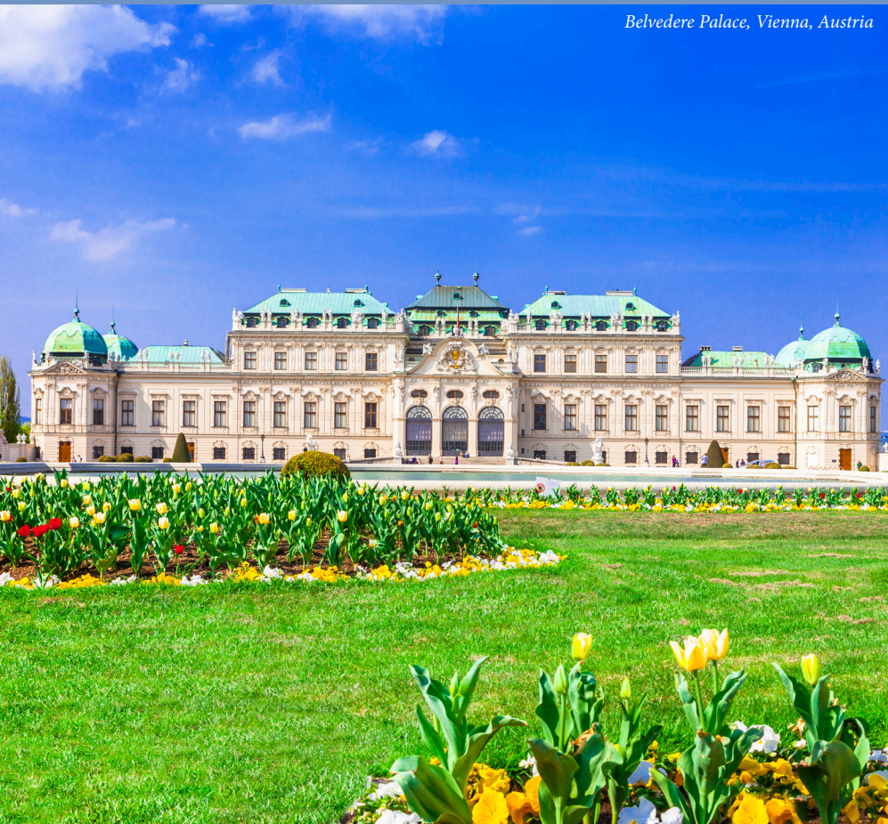
Belvedere Palace, Vienna, Austria