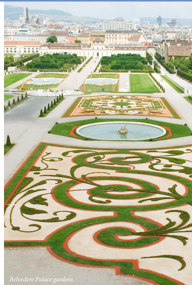
Belvedere Palace gardens